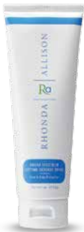
Daytime Defense SPF30

DAYTIME DEFENSE SPF30 – Face and Body Protection – For a refined finish to your daily skincare, Daytime Defense is the perfect protection for all skin types. Using zinc oxide to provide a natural sun barrier, this pure, clean formulation protects the skin while providing antioxidant benefits and soothing support without leaving skin white or pasty.