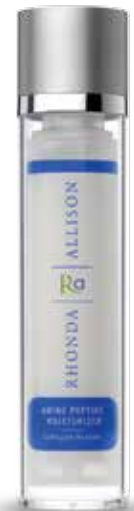
Amino Peptide Moisturizer

GROWTH FACTOR SERUM – Visible Renew With a high dose of EGF, this light serum boosts support for dryer skins – a must after any peel treatment. Works with all skin types.